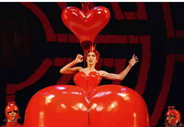
■ The Queen of Hearts (Christopher Wheeldon's ballet Alice's Adventures in Wonderland at the Royal Opera House in London).

"mouse-traps, and the moon, and memory, and muchness - you know you say things are 'much of a muchness' - did you ever see such a thing as a drawing of a muchness?"