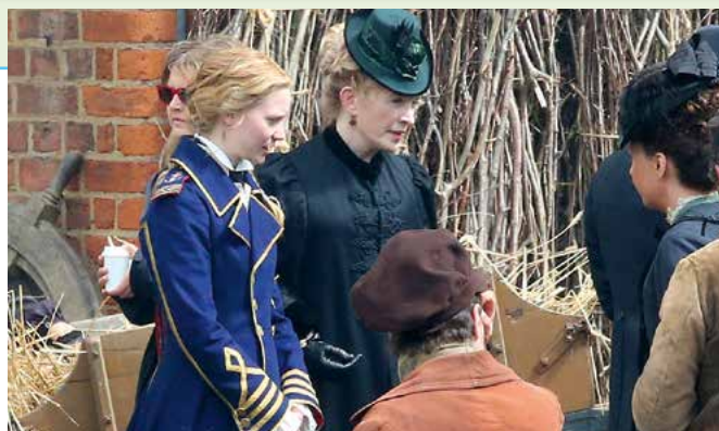
■ Alice in Wonderland: Through the Looking Glass (2016), the sequel to the Tim Barton's Alice.