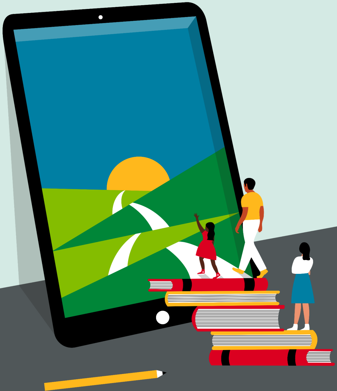
Illustration by Lucy Vigrass