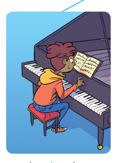
play the piano