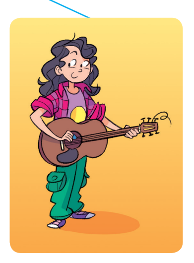
play the guitar