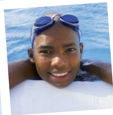
I relax by the pool

Everyday on holiday I get up at 7 o'clock and I go for a swim. Why do I do that? Because the pool is empty then. I eat cereal for breakfast and I have toast too – I am hungry in the morning. I don't have breakfast with my parents because they get up later. After that I get dressed and I walk into town. I go to the market but I don't buy anything, I just look at all the lovely food – there are lots of different types of fruits and vegetables. In the afternoon I go back to the villa. I relax by the pool with my mum. She reads and I just sunbathe.