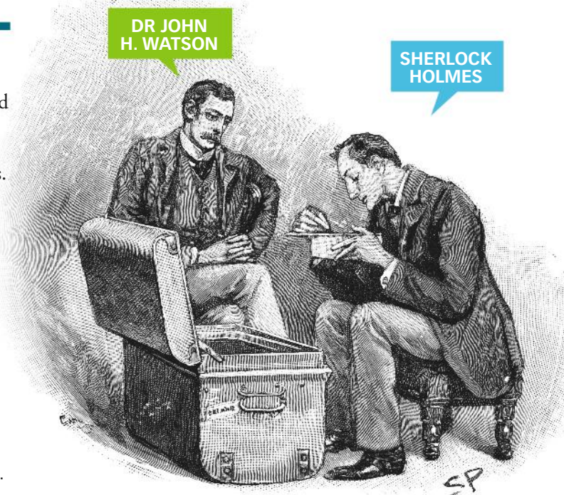
DR JOHN H. WATSON